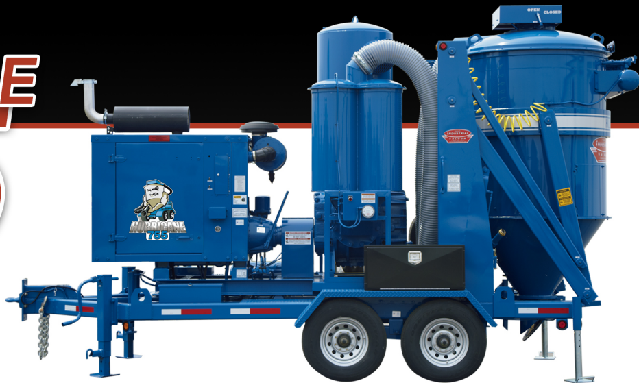
Dimensional drawing on other side