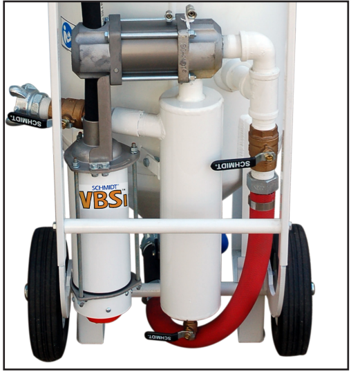
VBSII on the back of a Schmidt Abrasive Blaster

The Schmidt VBS II<sup>TM</sup> is the latest technology for suppressing the intensity of the air/energy during vessel depressurization of abrasive blasting systems. It is the only system specifically designed to safely reduce the noise levels and abrasive particle velocity (speeds) which occur during vessel blowdown.